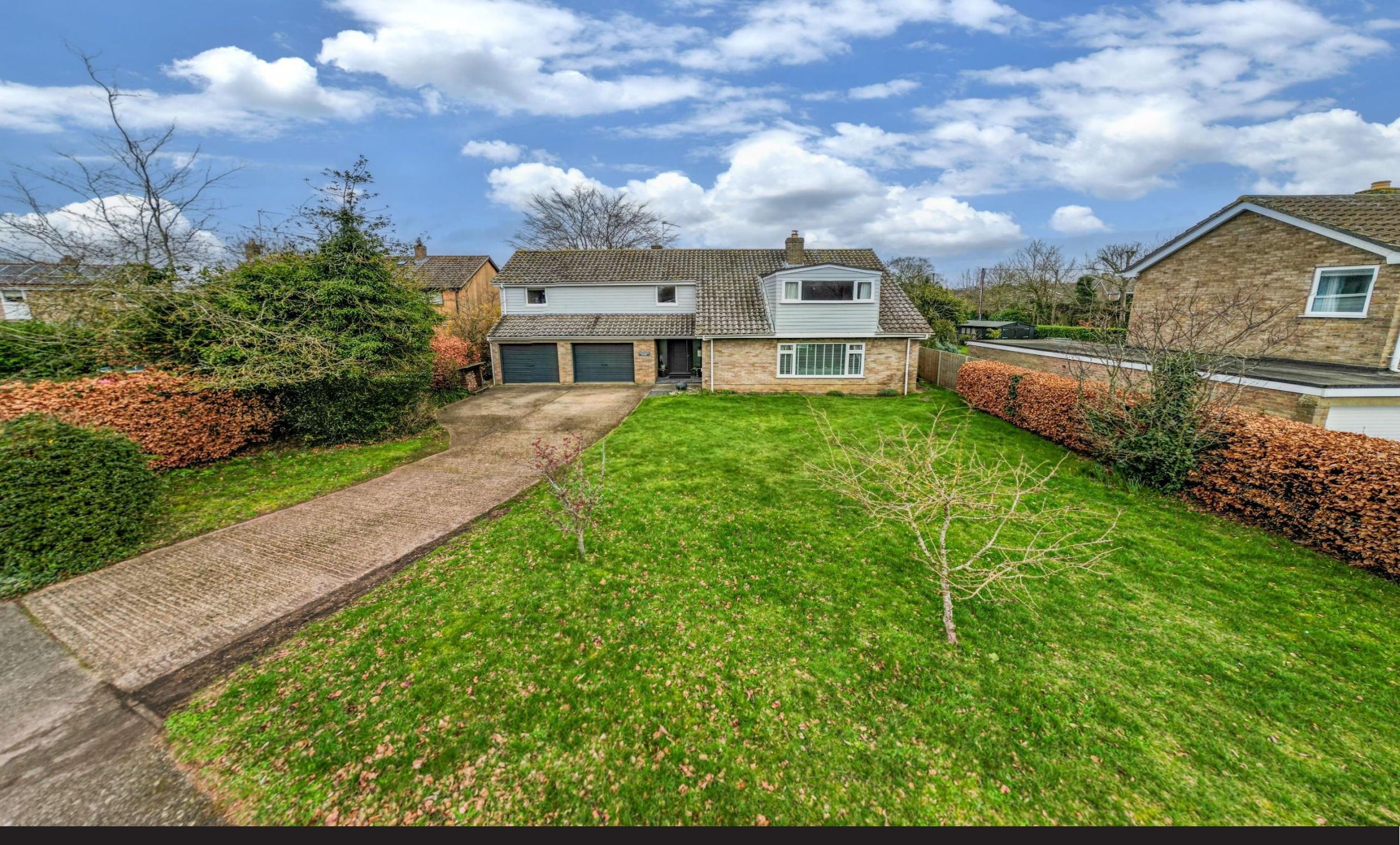
Aldridge Lane, Fornham All Saints, Bury St. Edmunds, Suffolk, IP28 6JT